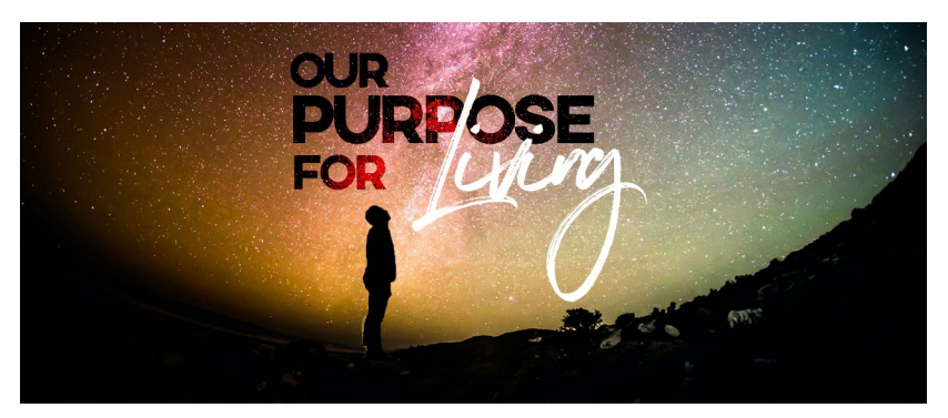
Your Mission If You Choose to Accept it November 26 & 27, 2022

Purpose 5 (gracE) – Our mission is to <u>Express</u> God's love by sharing the Good News about Jesus with everyone.